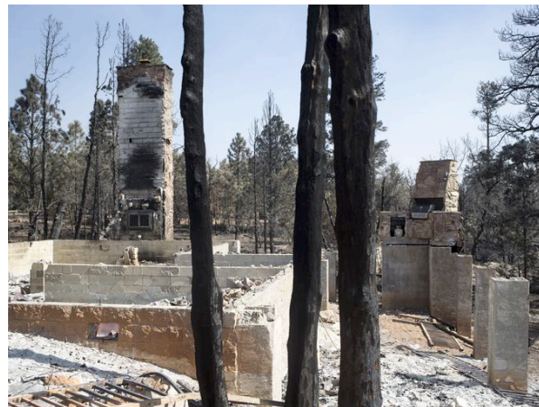
Tinder Fire North of Happy Jack, AZ April 2018.

There are obvious financial benefits to being Firewise at the time of an urban wildfire, since your life and home will be safer than those that are unprepared. In addition, homeowner insurance companies are paying attention to how being Firewise helps manage the risks.